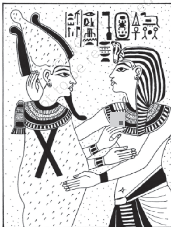
Mural in King Tut's tomb showing King Tut with Osiris, the god of the afterlife

Back in the trailer a technician pulled up astonishing images of Tut on a computer screen. A grey head took shape from a scattering of pixels, and the technician spun and tilted it in every direction. Neck vertebrae appeared as clearly as in an anatomy class. Other images revealed a hand, several views of the rib cage, and a transection of the skull. But for now the pressure was off. Sitting back in his chair, Zahi Hawass smiled, visibly relieved that nothing had gone seriously wrong. "I didn't sleep last night, not for a second," he said. "I was so worried. But now I think I will go and sleep."