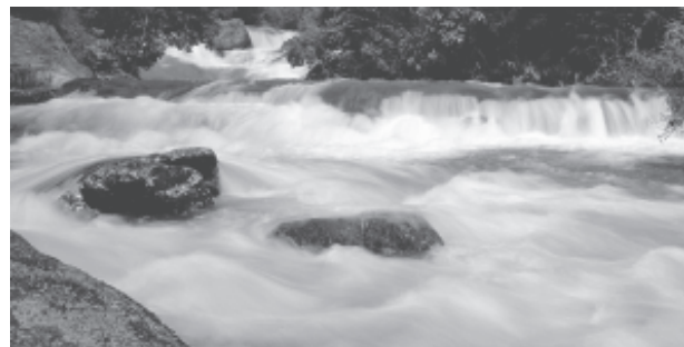
Figure 3.3 : Rapids

The Himalayan drainage system has evolved through a long geological history. It mainly includes the Ganga, the Indus and the Brahmaputra river basins. Since these are fed both by melting of snow and precipitation, rivers of this system are perennial. These rivers pass through the giant gorges carved out by the erosional activity carried on simultaneously with the uplift of the Himalayas. Besides deep gorges, these rivers also form V-shaped valleys, rapids and waterfalls in their mountainous