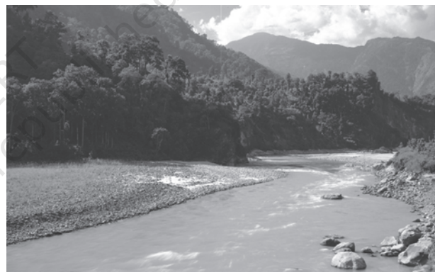
Figure 3.1 : A River in the Mountainous Region

2006) in this class . Can you, then, explain the reason for water flowing from one direction to the other? Why do the rivers originating from the Himalayas in the northern India and the Western Ghat in the southern India flow towards the east and discharge their waters in the Bay of Bengal?