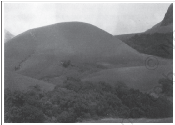
Figure 16.1 : Grasslands and sholas in Indira Gandhi National Park, Annamalai, Western Ghats — an example of ecosystem diversity

You have studied about the ecosystem in the earlier chapter. The broad differences between ecosystem types and the diversity of habitats and ecological processes occurring within each ecosystem type constitute the ecosystem diversity. The 'boundaries' of communities (associations of species) and ecosystems are not very rigidly defined. Thus, the demarcation of ecosystem boundaries is difficult and complex.