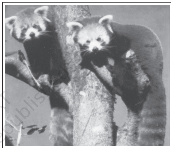
Figure 16.2 : Red Panda — an endangered species

It includes those species which are in danger of extinction. The IUCN publishes information about endangered species world-wide as the Red List of threatened species.