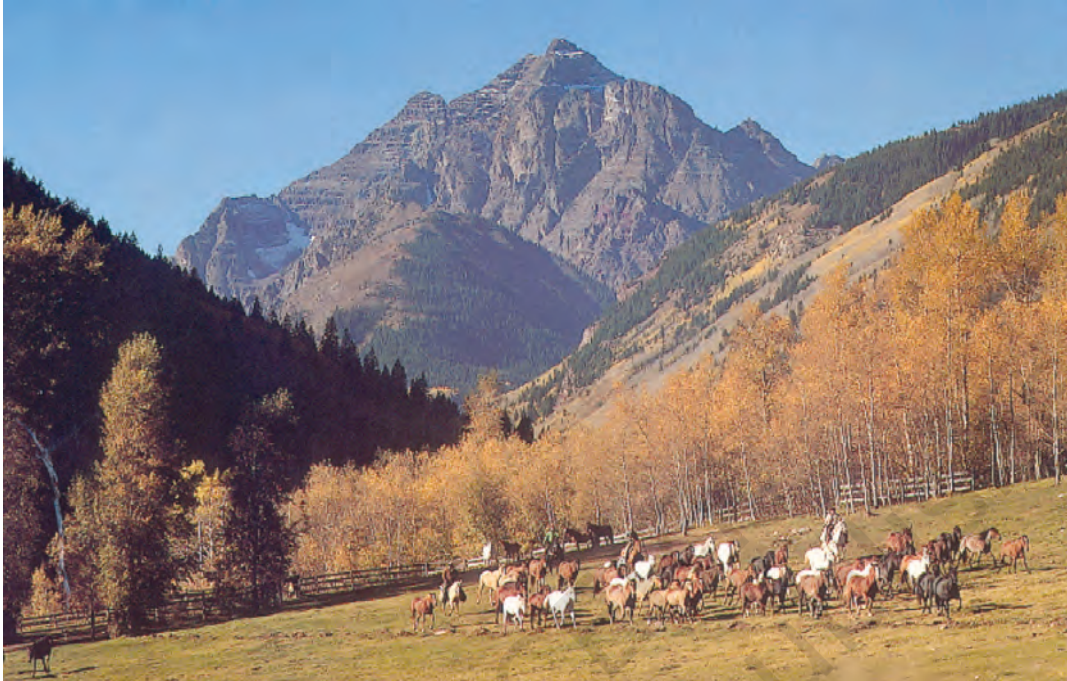
A ranch in Colorado.

The climate of the southern region was too hot for Europeans to work outdoors, and the experience of South American colonies had