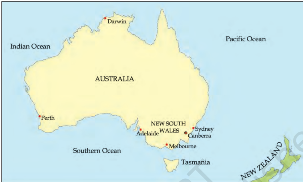
MAP 2: Australia

The story of the interaction between the European settlers, the native peoples and the land in Australia has many points of similarity to the story of the Americas, though it began nearly 300 years later. Initial reports from Captain Cook and his crew about encounters with natives are enthusiastic about their friendliness. There was a sharp reversal of feeling on the part of the British when Cook was killed by a native – not in Australia, but in Hawaii. As often happened, a single incident of this nature was used by colonisers to justify subsequent acts of violence towards other people.