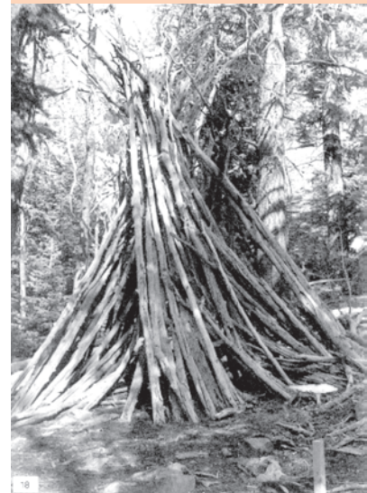
A native lodge, 1862. Archaeologists moved this from the mountains and placed it in a museum in Wyoming.

It is significant that it was at this time (from the 1840s) that the subject of 'anthropology' (which had been developed in France) was introduced in North America, out of a curiosity to study the differences between native 'primitive' communities and the 'civilised' communities of Europe. Some anthropologists argued that just as there were no 'primitive' people to be found in Europe, the American natives too would 'die out'.