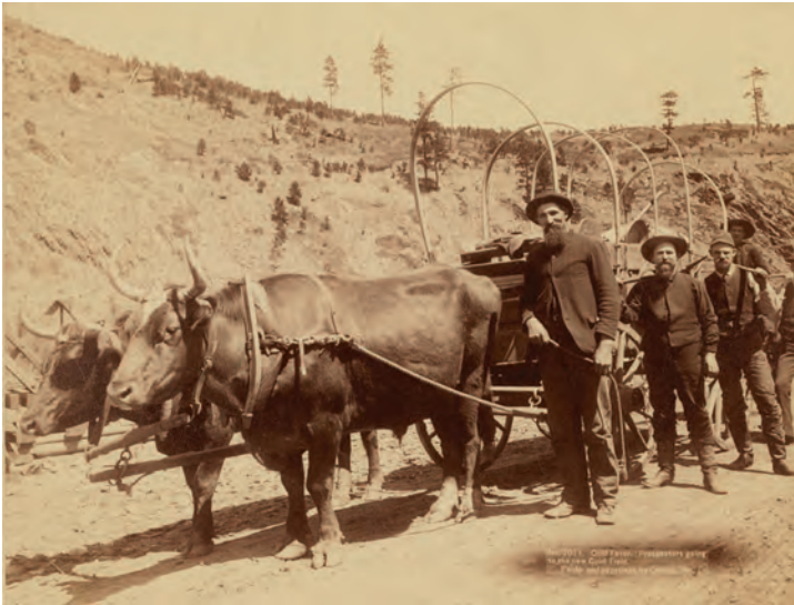
Moving to California as part of the 'Gold Rush', photograph.

transport could link distant places, and to produce machinery which would make large-scale farming easier. Industrial towns grew and factories multiplied, both in the USA and Canada. In 1860, the USA had been an undeveloped economy. In 1890, it was the leading industrial power in the world.