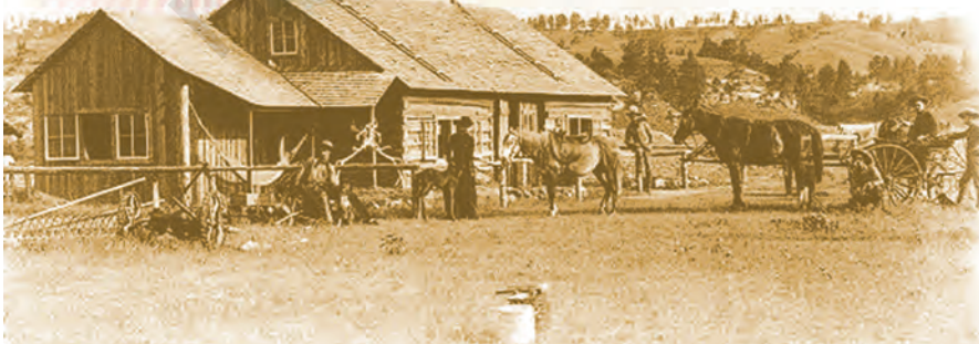
Below: The ranch on the prairie that was the dream of poor European immigrants, photograph.