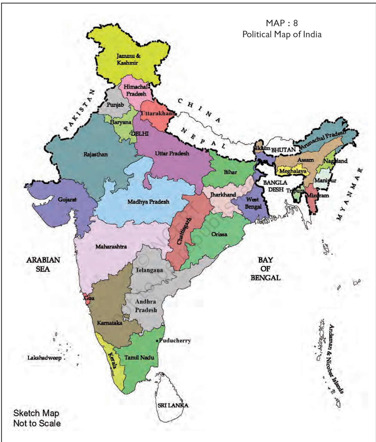
MAP : 8 Political Map of India