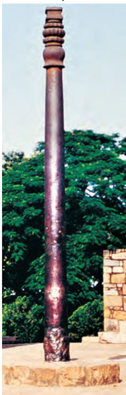
The iron pillar

on the pillar mentioning a ruler named Chandra, who probably belonged to the Gupta dynasty (Chapter 10). What is amazing is the fact that the pillar has not rusted in all these years.