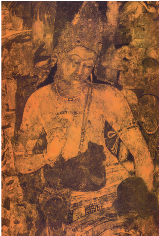
Paintings from Ajanta. Describe what you see in each of these paintings.

women who are known only by their names which were inscribed on pillars, railings and walls. So when you get a chance to visit any of these buildings, remember how several hundreds of people probably worked to construct and decorate them.