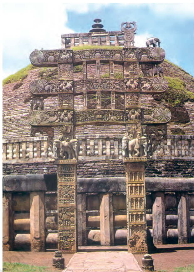
Top : The Great Stupa at Sanchi, Madhya Pradesh.

Stupas like this one were built over several centuries. While the brick mound probably dates to the time of Ashoka (Chapter 7), the railings and gateways were added during the time of later rulers.