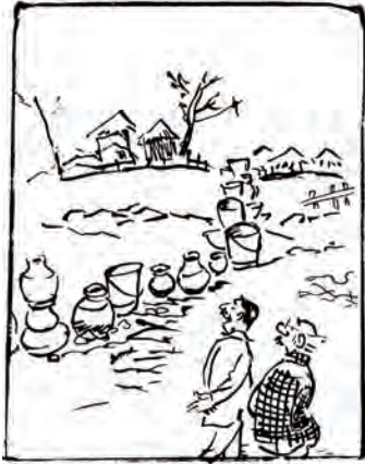
Not bad! One of the taps in the nearby village must be getting water!