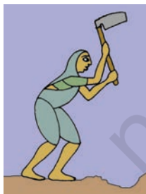
Labour is the source of all wealth

The third chapter initiates the learners into the world of money — its role in a modern economy, forms and its linkage with various institutions such as banks. Then the chapter moves on to discuss the role of banks and other institutions in providing credit to the people. Issues stressed in the discussion on credit are (a) pervasiveness of credit in economic life across a very large section of the population (b) the preponderance of informal credit in India and (c) role of credit in creating either a self-sustaining virtuous cycle of productive investment, higher income streams, higher standards of living leading to more productive investments contributing to development, or a vicious cycle of indebtedness, poverty and debt-trap leading to increased poverty. These ideas are presented through case studies.