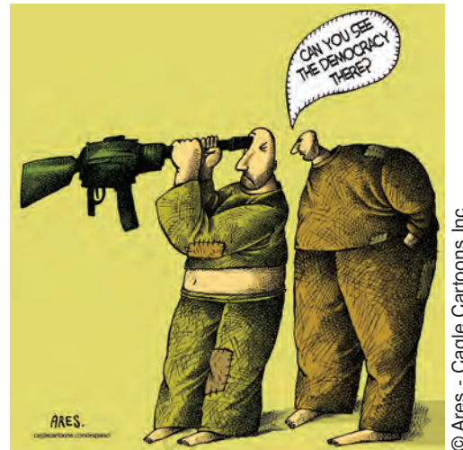
Seeing the democracy