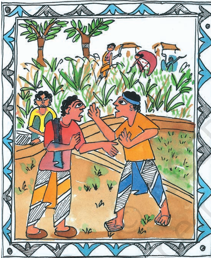
A Quarrel in the Village

There are more than six lakh villages in India. Taking care of their needs for water, electricity, road connections, is not a small task. In addition to this, land records have to be maintained and conflicts too need to be dealt with. A large machinery is in place to deal with all this. In this chapter we will look at the work of two rural administrative officers in some detail.