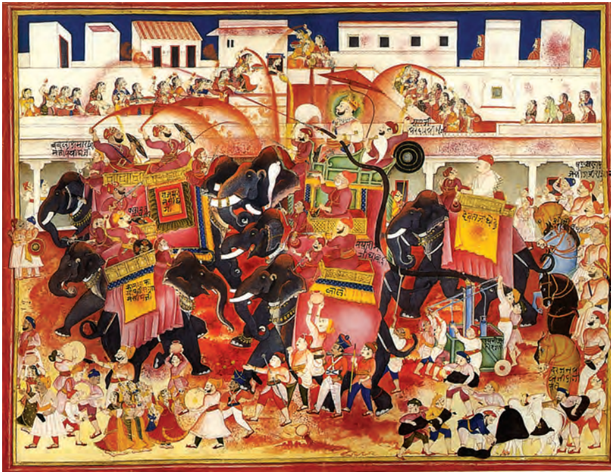
Fig. 8 Maharana Ram Singh II playing holi. Rajput miniature, Kota.

Pradesh. By the late seventeenth century this region had developed a bold and intense style of miniature painting called Basohli. The most popular text to be painted here was Bhanudatta's Rasamanjari . Nadir Shah's invasion and the conquest of Delhi in 1739 resulted in the migration of Mughal artists to the hills to escape the uncertainties of the plains. Here