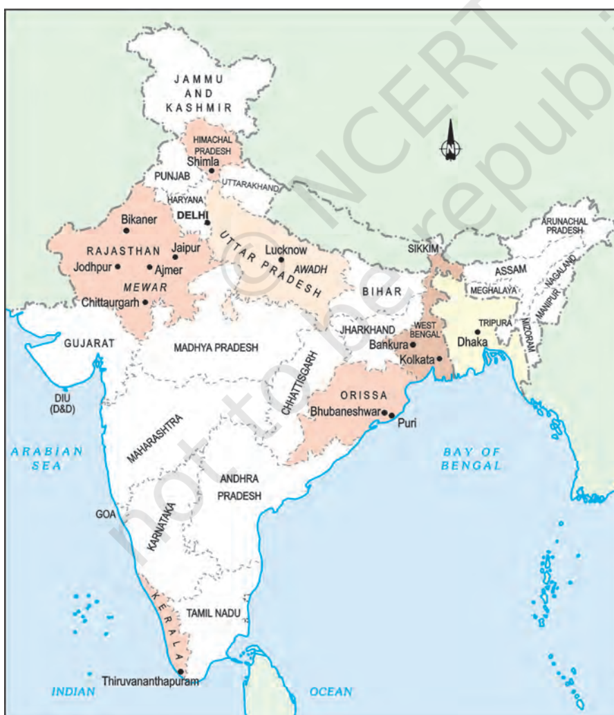
Map 1 Regions discussed in this chapter.

Did women find a place within these stories? Sometimes, they figure as the “cause” for conflicts, as men fought with one another to either “win” or “protect” women. Women are also depicted as following their heroic husbands in both life and death – there are stories about the practice of sati or the immolation of widows on the funeral pyre of their husbands. So those