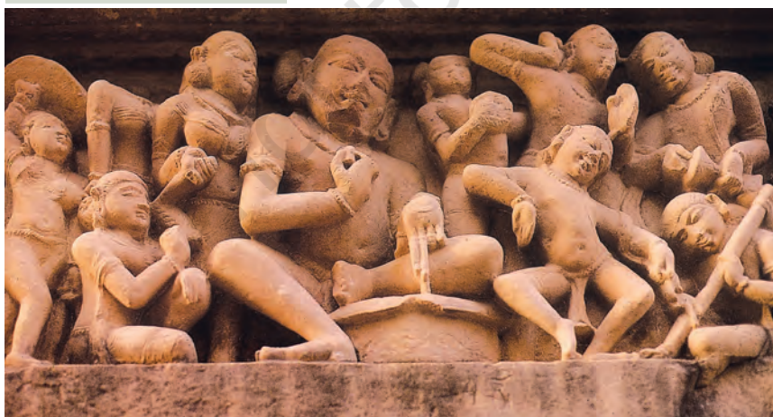
Fig. 5 Dance class, Lakshmana temple, Khajuraho.

who followed the heroic ideal often had to pay for it with their lives.