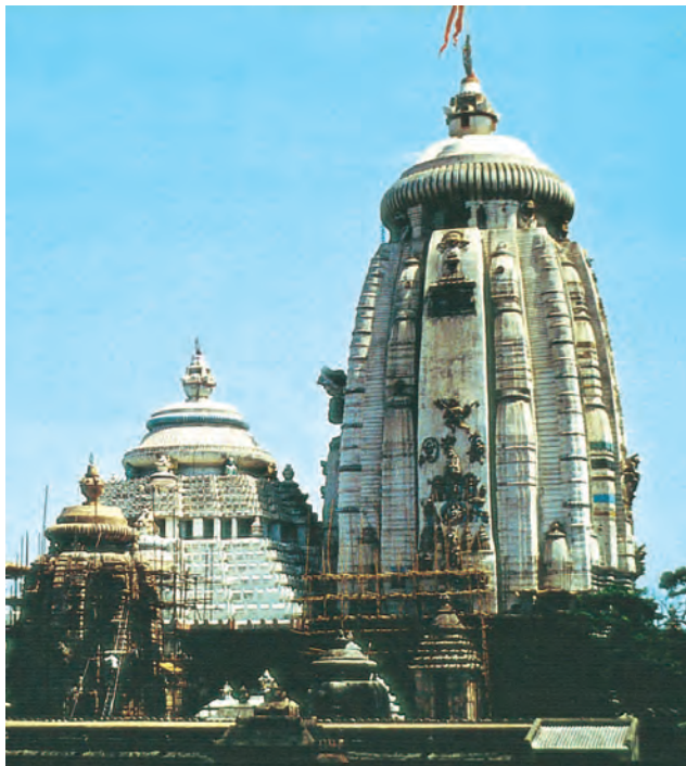
Fig. 3 Jagannatha temple, Puri.