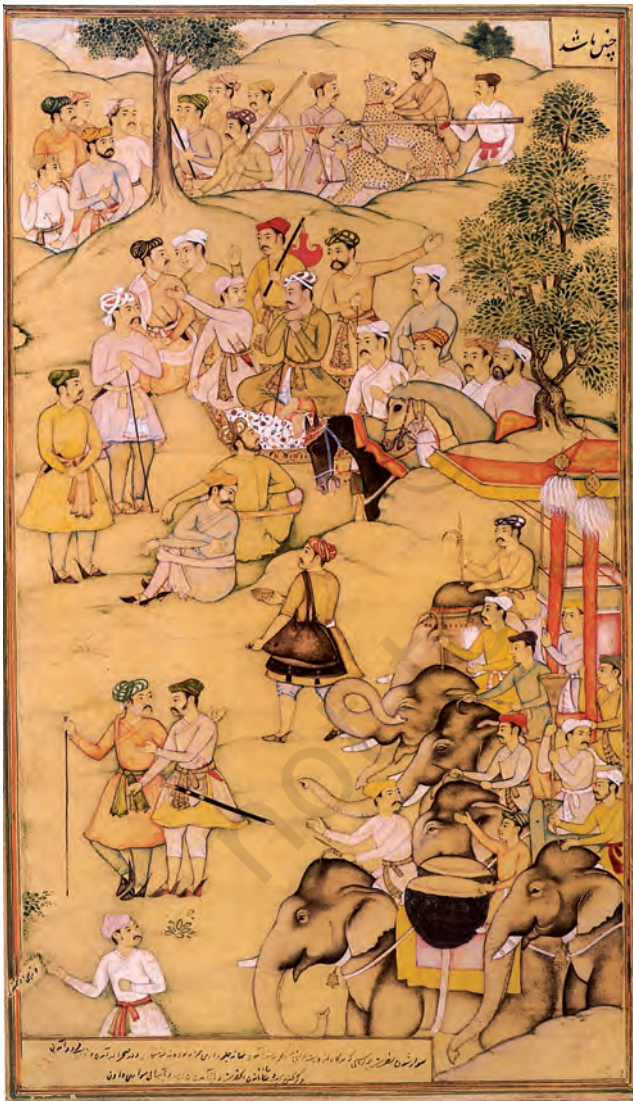
Fig. 7 Akbar resting during a hunt, Mughal miniature.

With the decline of the Mughal Empire, many painters moved out to the courts of the emerging regional states (see also Chapter 10). As a result Mughal artistic tastes influenced the regional courts of the Deccan and the Rajput courts of Rajasthan. At the same time, they retained and developed their distinctive characteristics. Portraits of rulers and court scenes came to be painted, following the Mughal example. Besides, themes from mythology and poetry were depicted at centres such as Mewar, Jodhpur, Bundi, Kota and Kishangarh.