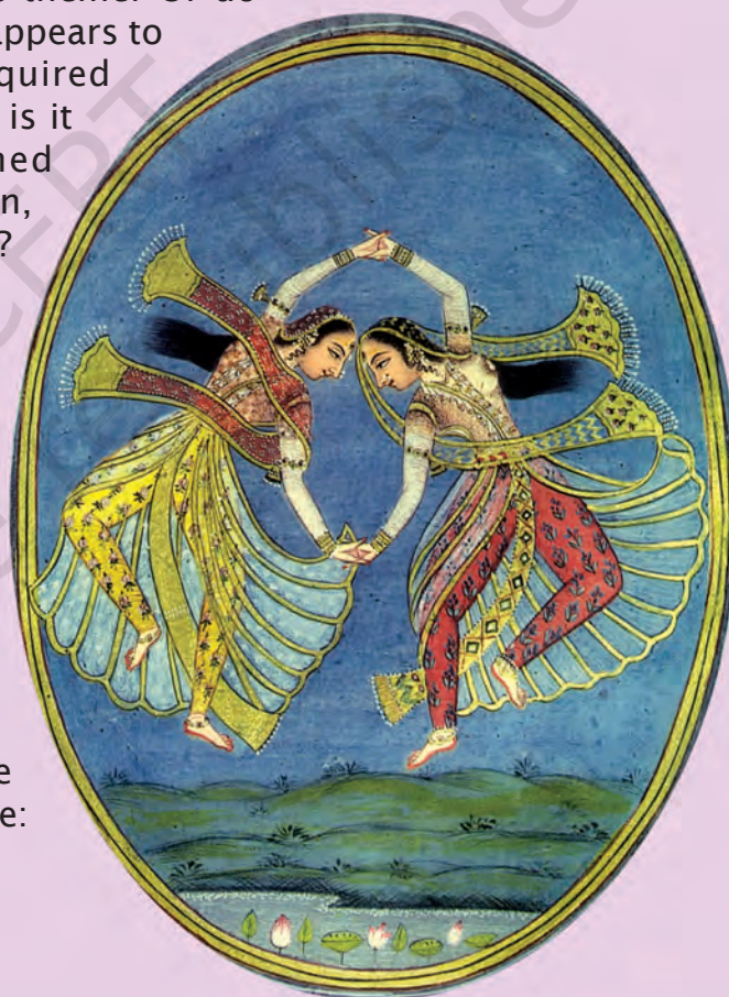
Fig. 6 Kathak dancers, a court painting.