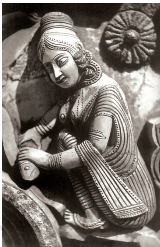
Fig. 14 Fish being dressed for domestic consumption, terracotta plaque from the Vishalakshi temple, Arambagh.

Brahmanas were not allowed to eat non-vegetarian food, but the popularity of fish in the local diet made the Brahmanical authorities relax this prohibition for the Bengal Brahmanas. The Brihadharma Purana , a thirteenth-century Sanskrit text from Bengal, permitted the local Brahmanas to eat certain varieties of fish.