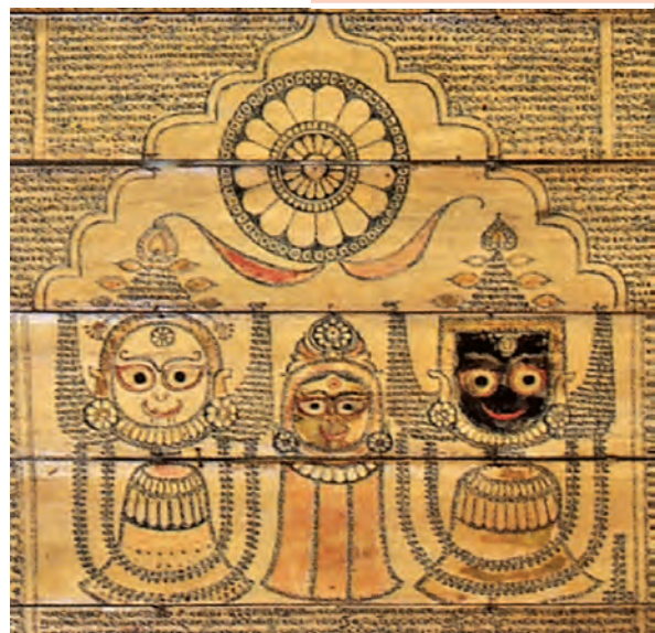
Fig. 2 The icons of Balabhadra, Subhadra and Jagannatha, palm-leaf manuscript, Orissa.

? Find out when the language(s) you speak at home were first used for writing.