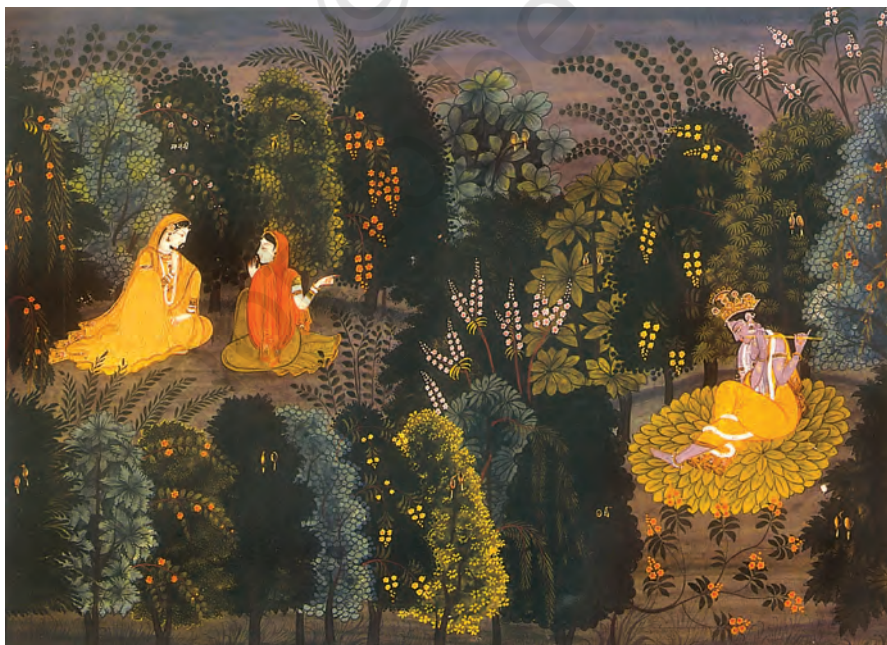
Fig. 9 Krishna, Radha and her companion, Pahari miniature, Kangra.

Pradesh. By the late seventeenth century this region had developed a bold and intense style of miniature painting called Basohli. The most popular text to be painted here was Bhanudatta's Rasamanjari . Nadir Shah's invasion and the conquest of Delhi in 1739 resulted in the migration of Mughal artists to the hills to escape the uncertainties of the plains. Here