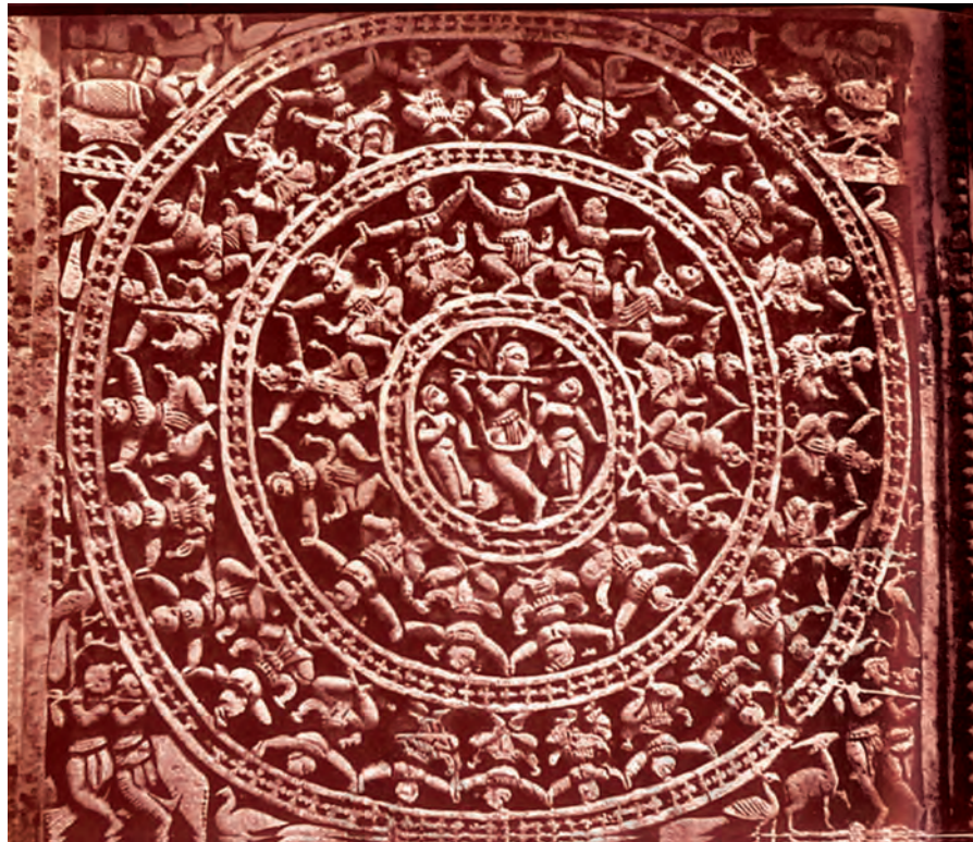
Fig. 13 Krishna with gopis, terracotta plaque from the Shyamaraya temple, Vishnupur.

they proclaimed their status through the construction of temples. When local deities, once worshipped in thatched huts in villages, gained the recognition of the Brahmanas, their images began to be housed in temples. The temples began to copy the double-roofed ( dochala ) or four-roofed ( chauchala ) structure of the thatched huts. (Remember the “Bangla dome” in Chapter 5?) This led to the evolution of the typical Bengali style in temple architecture.