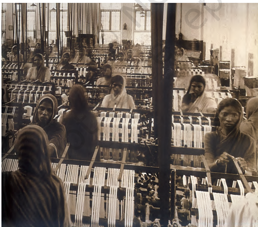
Fig. 10 – Workers in a cotton factory, circa 1900, photograph by Raja Deen Dayal

The first cotton mill in India was set up as a spinning mill in Bombay in 1854. From the early nineteenth century, Bombay had grown as an important port for the export of raw cotton from India to England and China. It was close to the vast black soil tract of western India where cotton was grown. When the cotton textile mills came up they could get supplies of raw material with ease.