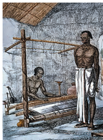
Fig. 9 – A tanti weaver of Bengal, painted by the Belgian painter Solvyns in the 1790s

By the beginning of the nineteenth century, English-made cotton textiles successfully ousted Indian goods from their traditional markets in Africa, America and Europe. Thousands of weavers in India were now thrown out of employment. Bengal weavers were the worst hit. English and European companies stopped buying Indian goods and their agents no longer gave out