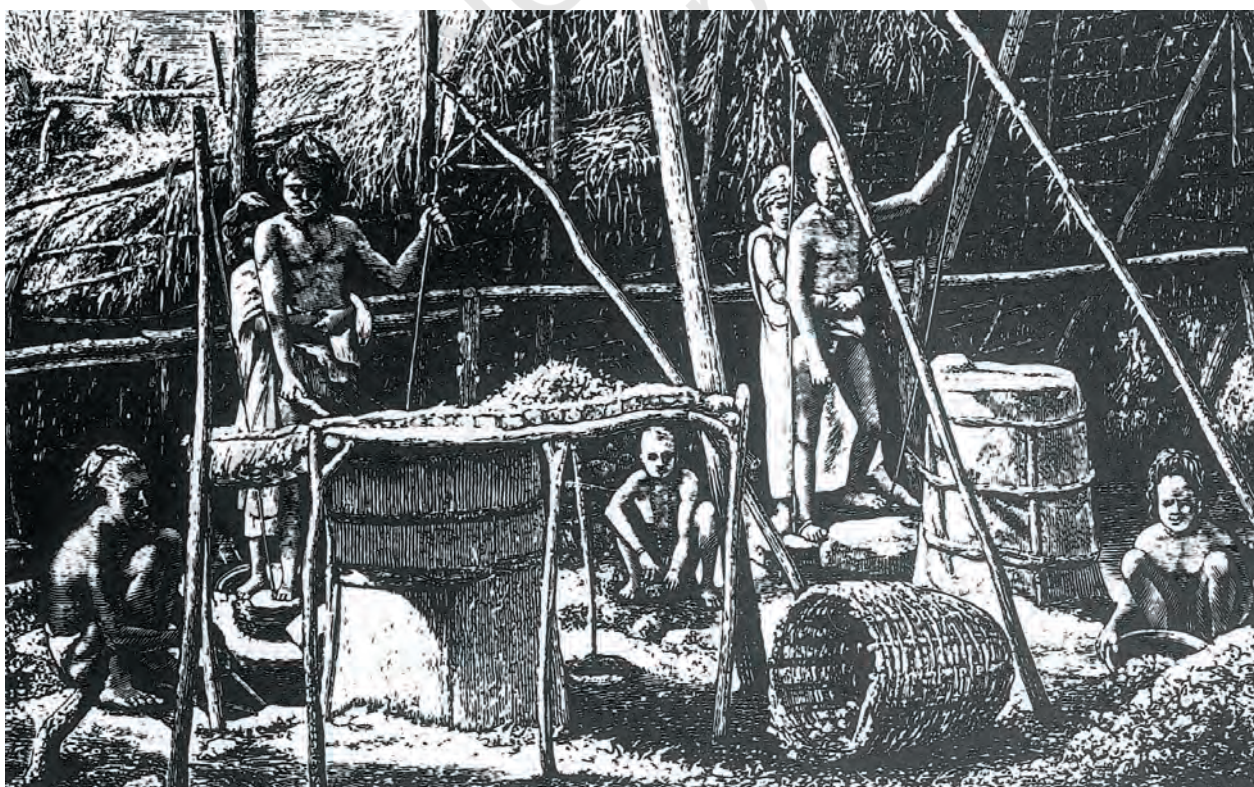
Fig. 12 – Iron smelters of Palamau, Bihar

Bellows – A device or equipment that can pump air