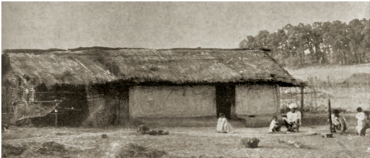
Fig. 13 – A village in Central India where the Agarias – a community of iron smelters – lived.

Some communities like the Agarias specialised in the craft of iron smelting. In the late nineteenth century a series of famines devastated the dry tracts of India. In Central India, many of the Agaria iron smelters stopped work, deserted their villages and migrated, looking for some other work to survive the hard times. A large number of them never worked their furnaces again.