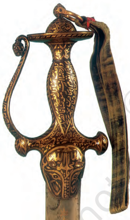
Fig. 11 – Tipu's sword made in the late eighteenth century

Francis Buchanan who toured through Mysore in 1800, a year after Tipu Sultan's death, has left us an account of the technique by which Wootz steel was produced in many hundreds of smelting furnaces in Mysore. In these furnaces, iron was mixed with charcoal and put inside small clay pots. Through an intricate control of temperatures the smelters produced steel ingots that were used for sword making not just in India but in West and Central Asia too. Wootz is an anglicised