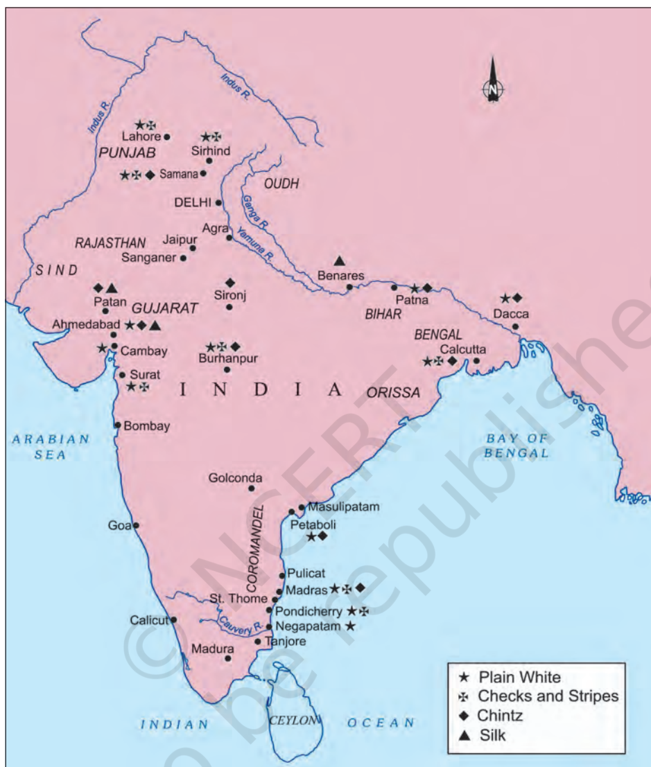
Fig. 8 – Weaving centres: 1500-1750

If you look at the map you will notice that textile production was concentrated in four regions in the early nineteenth century. Bengal was one of the most important centres. Located along the numerous rivers in the delta, the production centres in Bengal could easily transport goods to distant places. Do not forget that in the early nineteenth century railways had not developed and roads were only just beginning to be laid on an extensive scale.