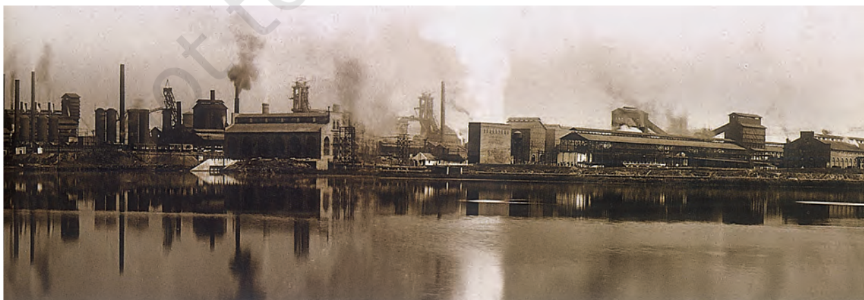
Fig. 14 – The Tata Iron and Steel factory on the banks of the river Subarnarekha, 1940

Slag heaps – The waste left when smelting metal