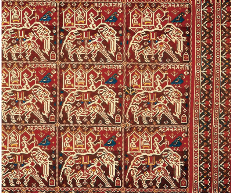
Fig. 2 – Patola weave, mid-nineteenth century

Let us first look at textile production.