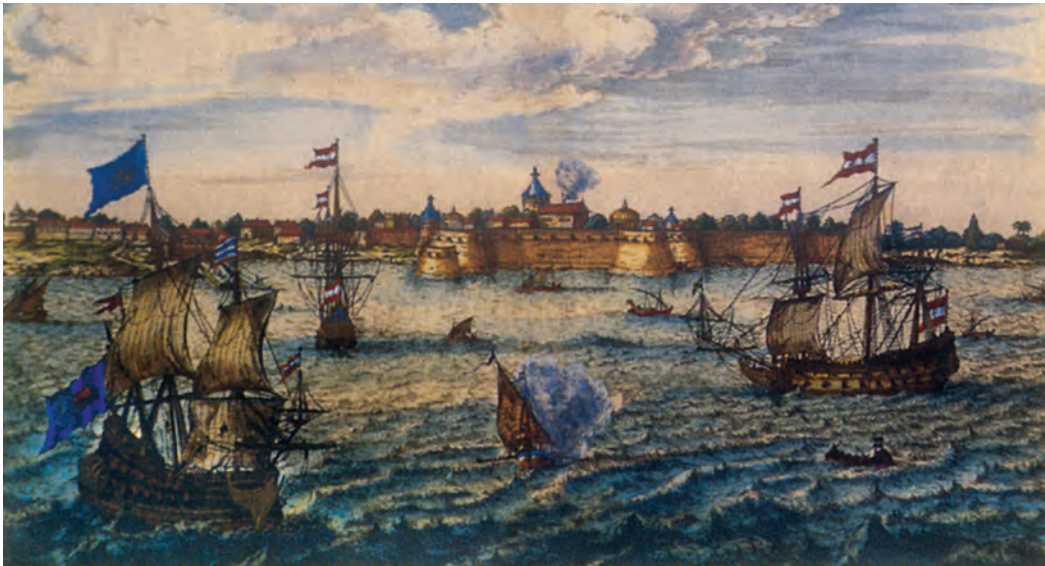
Fig. 1 – Trading ships on the port of Surat in the seventeenth century

Surat in Gujarat on the west coast of India was one of the most important ports of the Indian Ocean trade. Dutch and English trading ships began using the port from the early seventeenth century. Its importance declined in the eighteenth century.