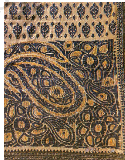
Fig. 4 – Jamdani weave, early twentieth century

Notice how each item in the order book was carefully priced in London. These orders had to be placed two years in advance because this was the time required to send orders to India, get the specific cloths woven and shipped to Britain. Once the cloth pieces arrived in London they were put up for auction and sold.