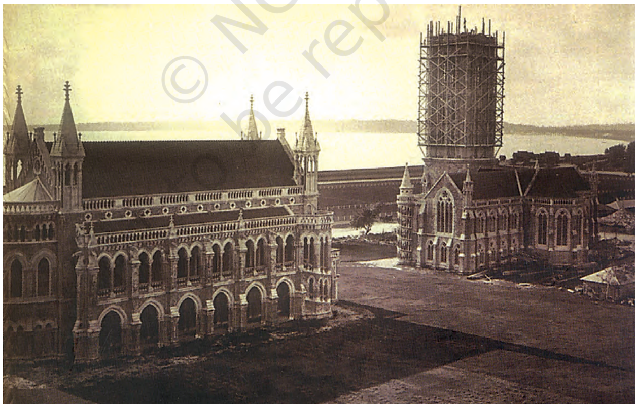
Fig. 5 – Bombay University in the nineteenth century

We must emphatically declare that the education which we desire to see extended in India is that which has for its object the diffusion of the improved arts, services, philosophy, and literature of Europe, in short, European knowledge.