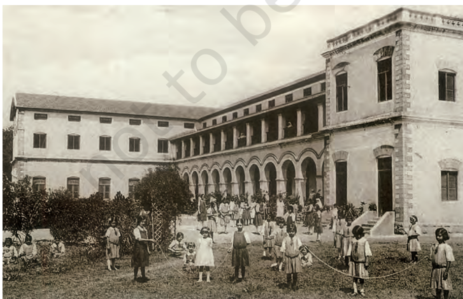
Fig. 12 – Children playing in a missionary school in Coimbatore, early twentieth century

Many individuals and thinkers were thus thinking about the way a national educational system could be fashioned. Some wanted changes within the system set up by the British, and felt that the system could be extended so as to include wider sections of people. Others urged that alternative systems be created so that people were educated into a culture that was truly national. Who was to define what was truly national? The debate about what this “national education” ought to be continued till after independence.