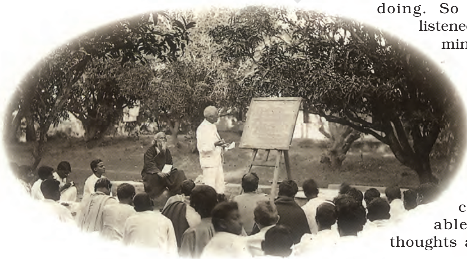
Fig. 11 – A class in progress in Santiniketan in the 1930s Notice the surroundings – the trees and the open spaces.

The experience of his schooldays in Calcutta shaped Tagore’s ideas of education. On growing up, he wanted to set up a school where the child was happy, where she could be free and creative, where she was able to explore her own thoughts and desires. Tagore felt