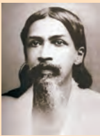
Fig. 9 – Sri Aurobindo Ghose

In a speech delivered on January 15, 1908 in Bombay, Aurobindo Ghose stated that the goal of national education was to awaken the spirit of nationality among the students. This required a contemplation of the heroic deeds of our ancestors. The education should be imparted in the vernacular so as to reach the largest number of people. Aurobindo Ghose emphasised that although the students should remain connected to their own roots, they should also take the fullest advantage of modern scientific discoveries and Western experiments in popular governments. Moreover, the students should also learn some useful crafts so that they could be able to find some moderately remunerative employment after leaving their schools.