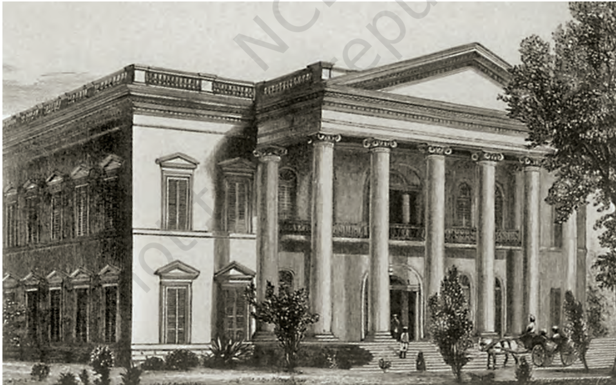
Fig. 7 – Serampore College on the banks of the river Hooghly near Calcutta

Over the nineteenth century, missionary schools were set up all over India. After 1857, however, the British government in India was reluctant to directly support missionary education. There was a feeling that any strong attack on local customs, practices, beliefs and religious ideas might enrage “native” opinion.