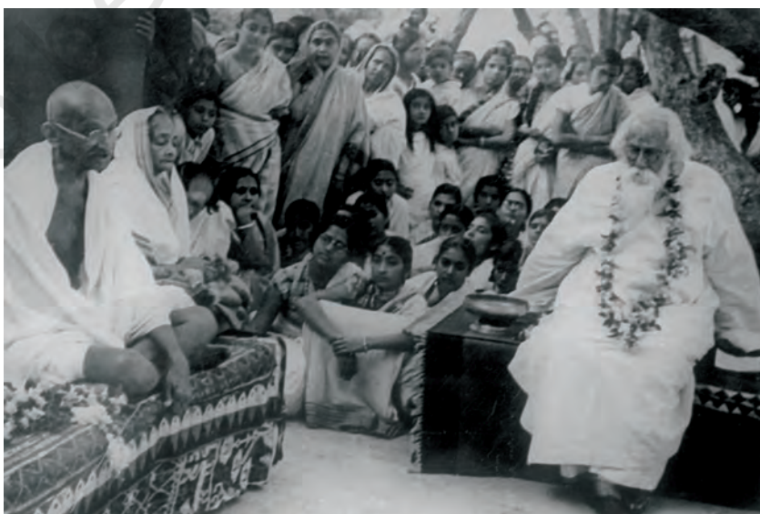
Fig. 10 – Mahatma Gandhi along with Kasturba Gandhi sitting with Rabindranath Tagore and a group of girls at Santiniketan, 1940

Western education, Mahatma Gandhi said, focused on reading and writing rather than oral knowledge; it valued textbooks rather than lived experience and practical knowledge. He argued that education ought to develop a person’s mind and soul. Literacy – or simply learning to read and write – by itself did not count as education. People had to work with their hands, learn a craft, and know how different things operated. This would develop their mind and their capacity to understand.