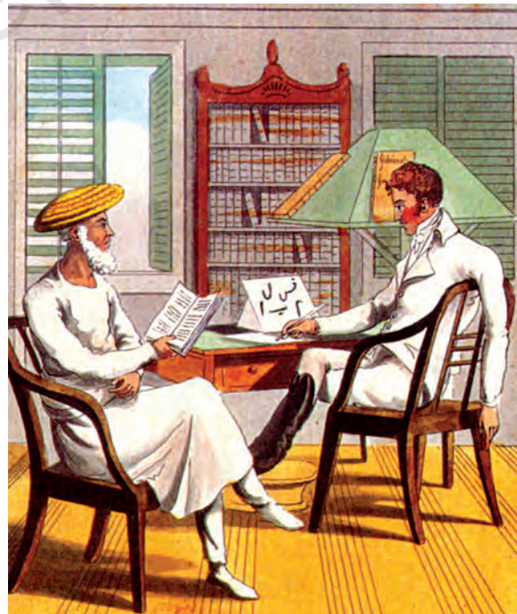
Fig. 1 – William Jones learning Persian

In 1783, a person named William Jones arrived in Calcutta. He had an appointment as a junior judge at the Supreme Court that the Company had set up. In addition to being an expert in law, Jones was a linguist . He had studied Greek and Latin at Oxford, knew French and English, had picked up Arabic from a friend, and had also learnt Persian. At Calcutta, he began spending many hours a day with pandits who taught him the subtleties of Sanskrit language, grammar and