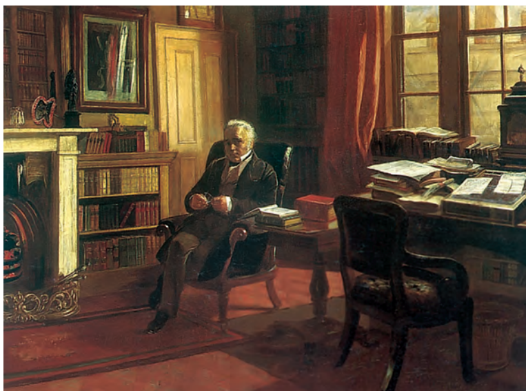
Fig. 4 – Thomas Babington Macaulay in his study