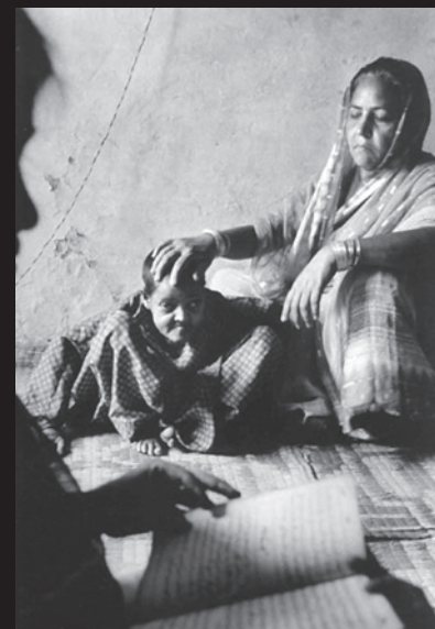
A child severely affected by the gas

Most of those exposed to the poison gas came from poor, working-class families, of which nearly 50,000 people are today too sick to work. Among those who survived, many developed severe respiratory disorders, eye problems and other disorders. Children developed peculiar abnormalities, like the girl in the photo.