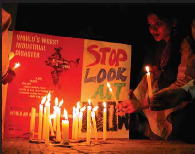
The struggle for justice goes on...

24 years later, people are still fighting for justice: for safe drinking water, for health-care facilities and jobs for the people poisoned by UC. They also demand that Anderson, the UC chairman who faces criminal charges, be prosecuted.