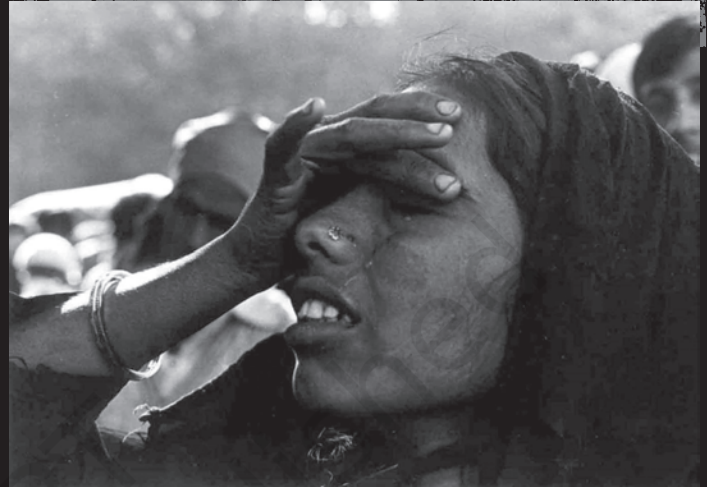
The next morning