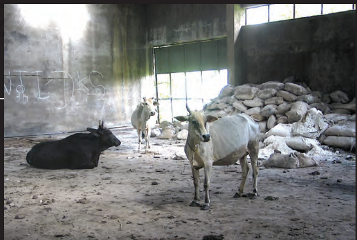
Bags of chemicals lie strewn around the UC plant

UC stopped its operations, but left behind tons of toxic chemicals. These have seeped into the ground, contaminating water. Dow Chemical, the company who now owns the plant, refuses to take responsibility for clean up.