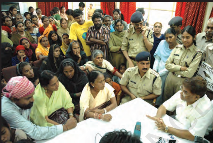
Gas victims with the Gas Relief Minister

Despite the overwhelming evidence pointing to UC as responsible for the disaster, it refused to accept responsibility.