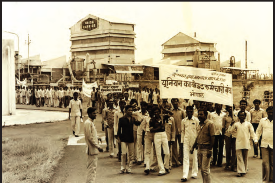
Members of UC Employees Union protesting

The disaster was not an accident. UC had deliberately ignored the essential safety measures in order to cut costs. Much before the Bhopal disaster, there had been incidents of gas leak killing a worker and injuring several.