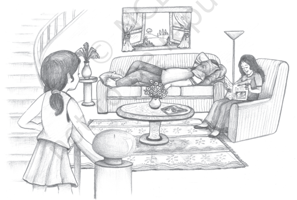
The little girl always found Mother reading and Father stretched out on the sofa.

wretched: unhappy on the brink of suicide: about to commit suicide